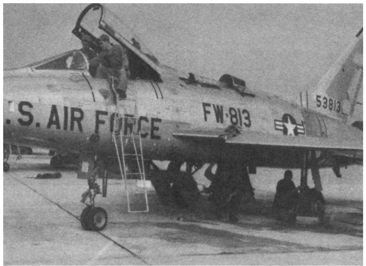
354<sup>th</sup> Field Maintenance Squadron personnel service an F-100 at Myrtle Beach AFB.