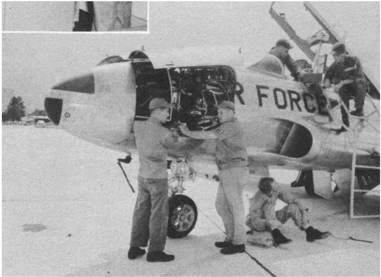
354<sup>th</sup> Field Maintenance Squadron personnel service a T-33.