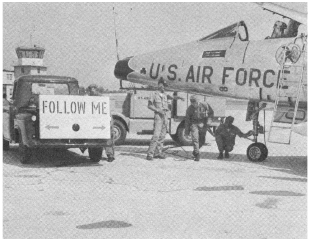
354<sup>th</sup> Field Maintenance Squadron personnel service an F-100.